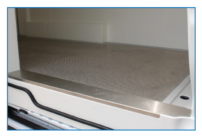
- Stainless steel doorstep protection