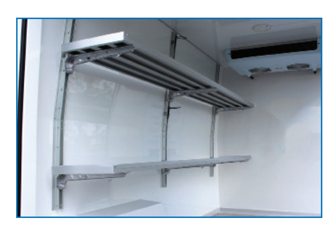
Aluminum fold-down shelves